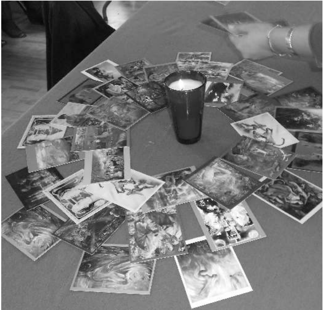
Citizen Report: A Pending Debt

in spite of the creation of the Prosecutor's Office for the Investigation of Socially-Significant Crimes, as it does not possess the required budget or personnel trained in the topic. For example, none of the aggressions against woman defenders that were denounced in 2012 were punished, in spite of the fact that in some cases the aggressors have been identified. IX