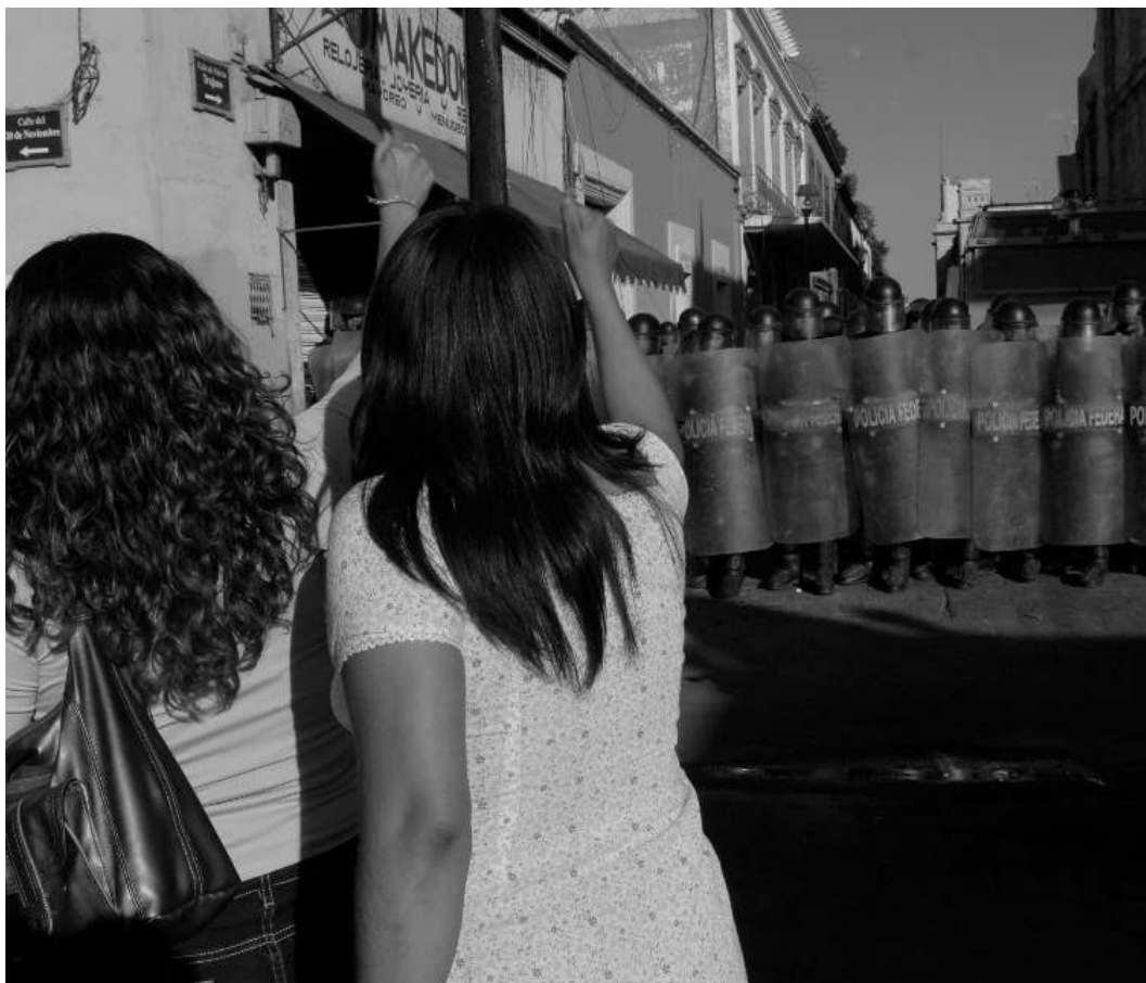
Citizen Report: A Pending Debt

338. Oaxaca is experiencing a social and political crisis that sharpened in 2006 and which it has yet to overcome. The Oaxacan government presents itself as a defender of human rights and appears to condemn crimes committed by previous governments, but in fact criminalizes those who protest.